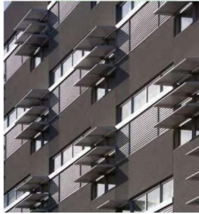
223 Yale LEED GOLD