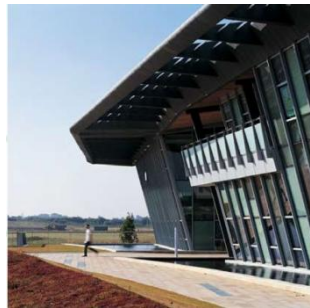
The Wellcome Trust Genome Campus BREEAM excellent