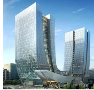
Korea Telecom Headquarters LEED PLATINUM