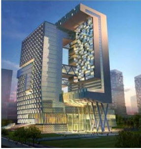
Samsung Learning Center LEED GOLD