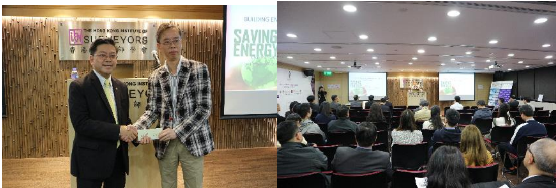
28 Nov 2017