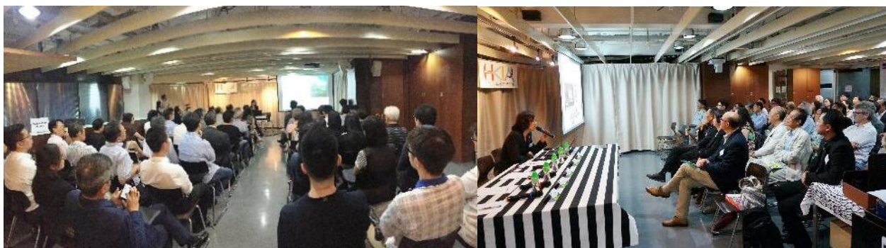
9 Aug 2017