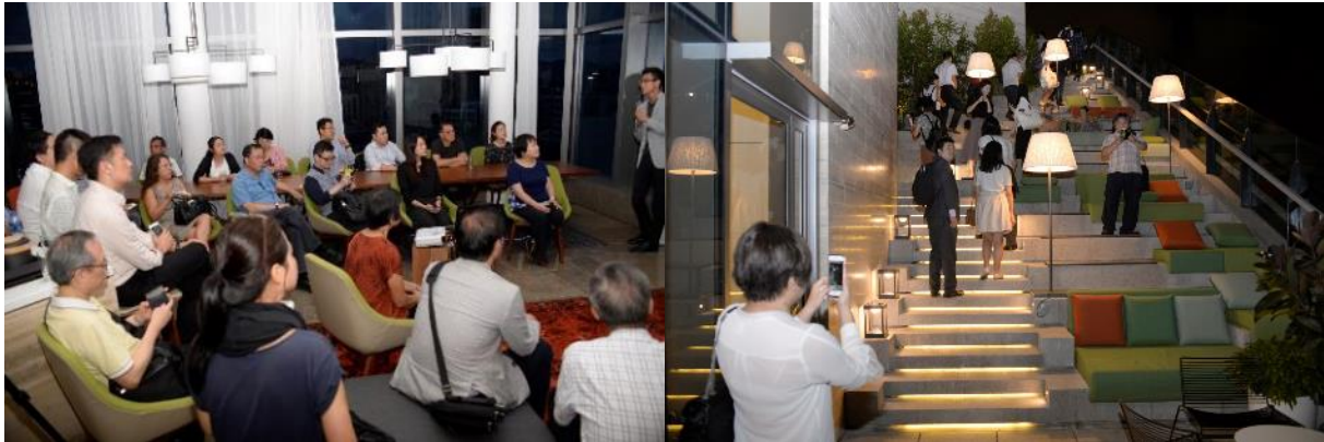
29 Sep 2017