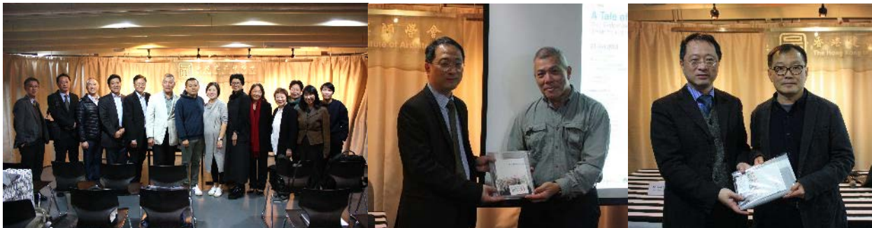
23 Jan 2018